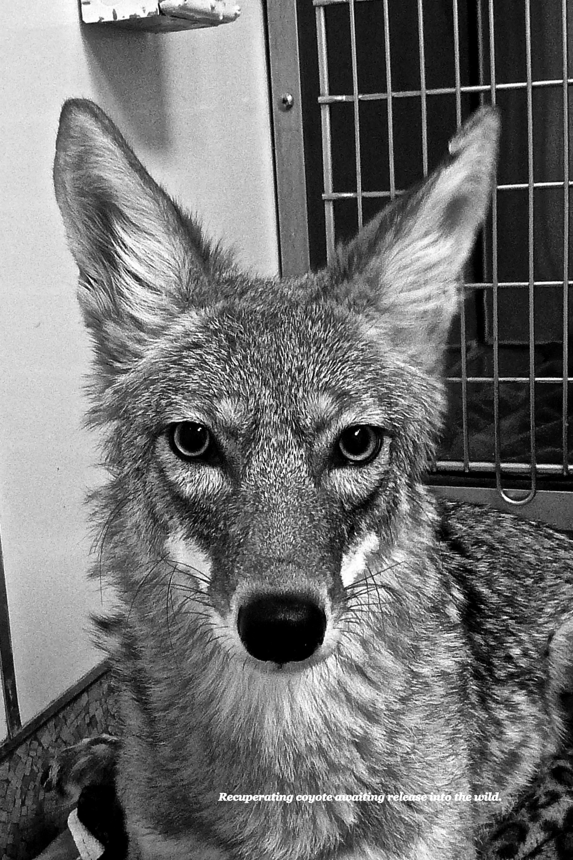
Recuperating coyote awaiting release into the wild.