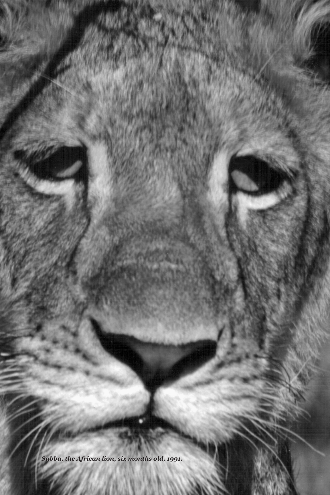
Sabba, the African lion, six months old, 1991.