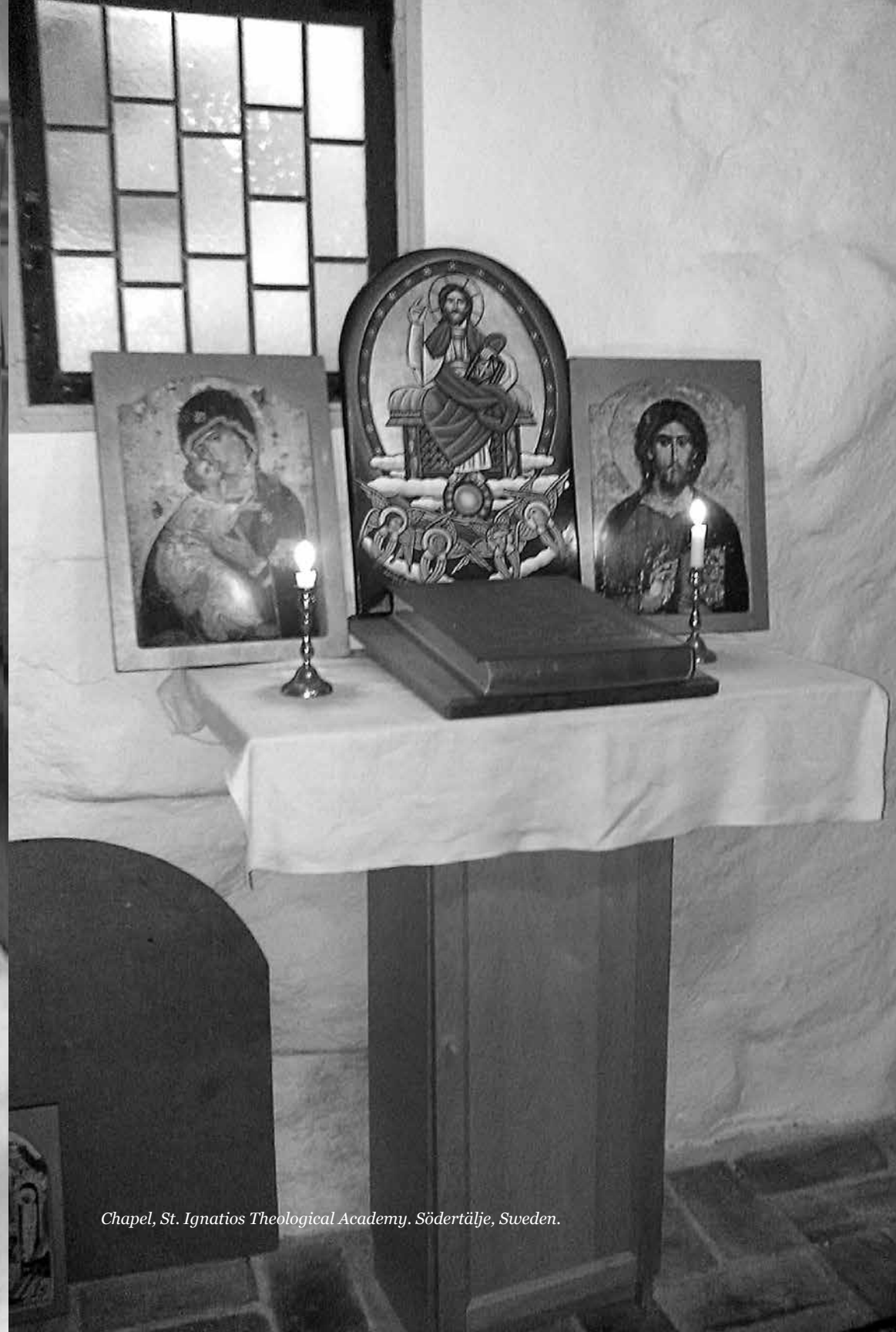
Chapel, St. Ignatios Theological Academy, Södertälje, Sweden.