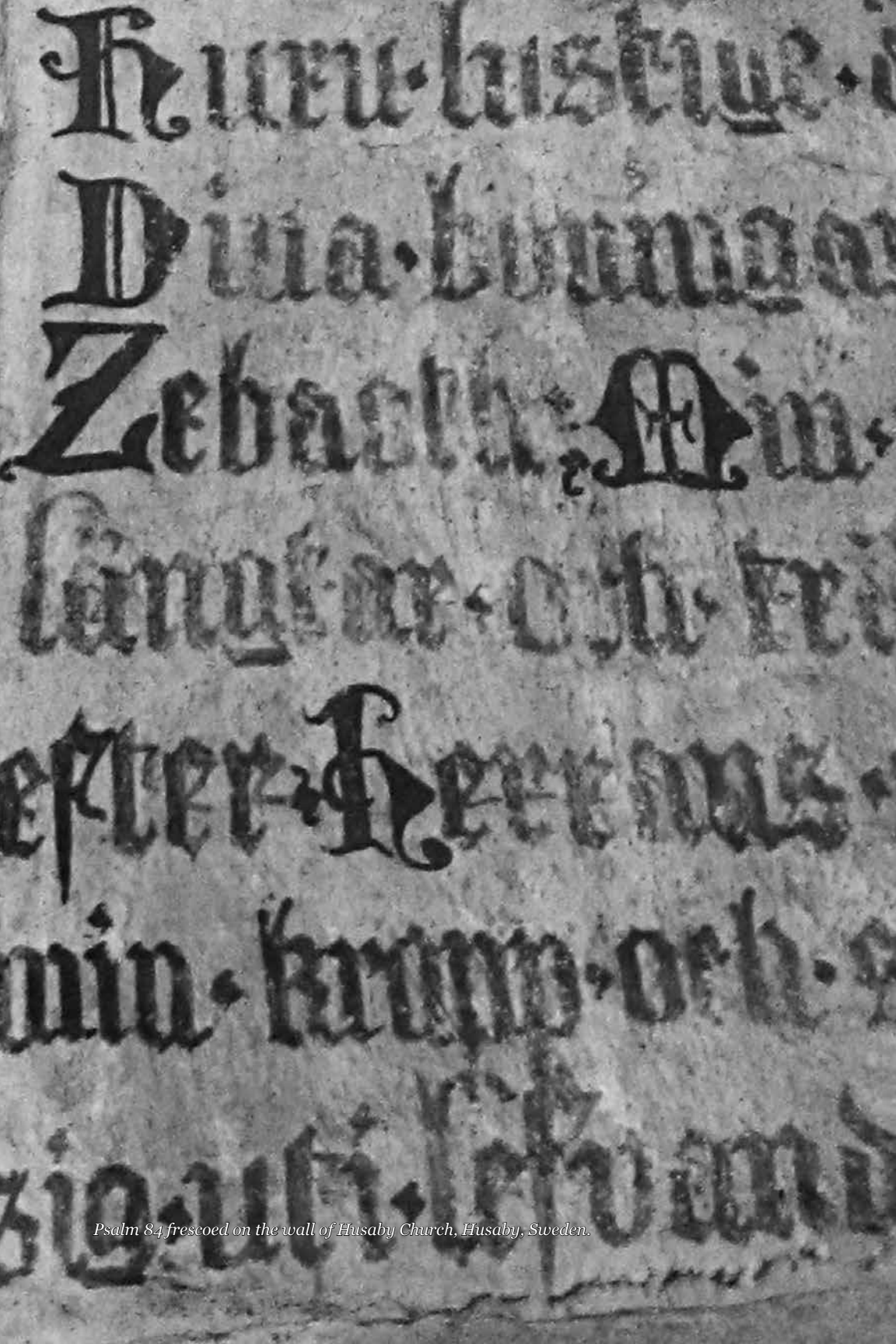
Interior, Husaby Church, near Kinnekulle, Sweden.