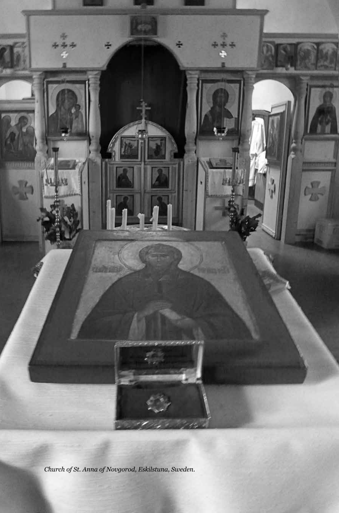
Church of St. Anna of Novgorod, Eskilstuna, Sweden.