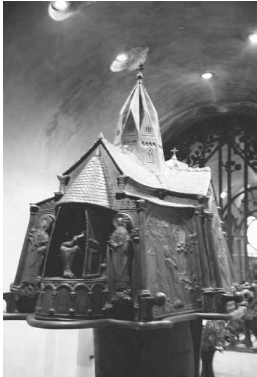
Grave of St. Luidger. Essen-Werden, Germany.

family moved back to the region near Utrecht. Their home was open to the great Christian missionaries of the day, and as a young boy Luidger met St. Boniface there, shortly before the latter's martyrdom. From his family history and from these encounters with missionaries, Luidger was inspired to bring Christianity to the barbarians. His fluency in the Frisian language and familiarity with Frisian beliefs and customs, as well as an outstanding monastic education in Utrecht and York (England), added to his qualifications.