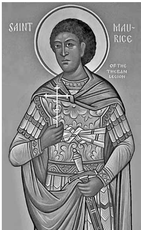
St. Maurice, fresco from St. Innocent Orthodox Church, Redford, Michigan.

adopted Christianity. The first recorded miracle in a German-speaking country resulted from the prayers of Christians in the Roman army. On June 11 in the year 172, in what is now northern Austria, the Roman army was trapped without water on a very hot day as they were fighting the barbarian Markamanni and Quadi. The army was about to succumb to the heat when, in response to the prayers of Christian soldiers, God sent a storm which refreshed the Romans and frightened the barbarians, who were then soundly defeated.