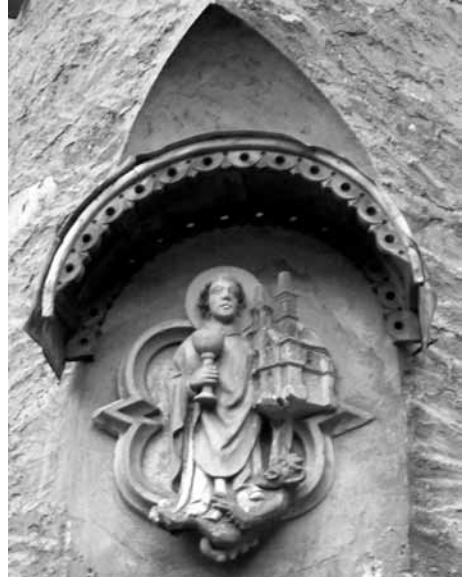
An early depiction of St. Goar. St. Goar, Germany.

This was the beginning of an extraordinary mission, in which the entire region came to look to Severinus’ clairvoyant guidance for safety and salvation. He founded monasteries, advised kings, freed captives, and fed and clothed the people. He knew when fighting would be successful, or when it was time to flee. He taught the people