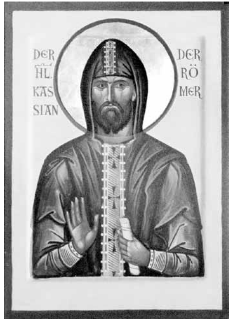
Saint Cassian the Roman.

For a number of years Constantine, like his father before him, was the head of the western half of the Roman Empire, and had the city of Trier (Germany) as his capital. To this fact we owe the extraordinary spiritual treasures which we find in this city today. His mother, St. Helena, having journeyed to Palestine and uncovered the True Cross, brought one of the nails of the Cross to Trier. It is believed that Bishop