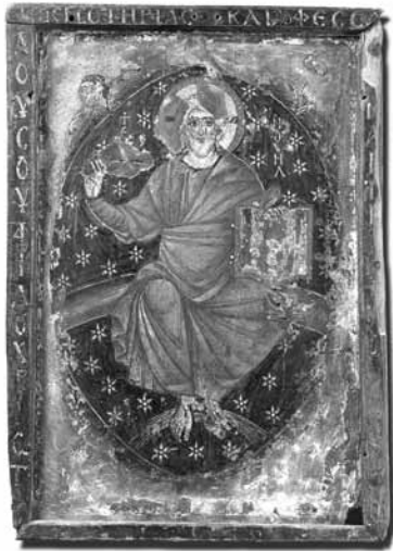
Christ as the Ancient of Days.

This is what I'm working on in Just Genesis —trying to extend our understanding of Holy Tradition as Reality. This effort has completely and radically changed my life. When someone asks, "Do you really believe that stuff in the Bible?" I say, "Absolutely." When I'm asked if I think that every word in the Bible is true, I respond: "There is so much truth that we can't get our minds around it. I've spent 32 years studying just the first book—and I am blown away by how it speaks reliable truth."