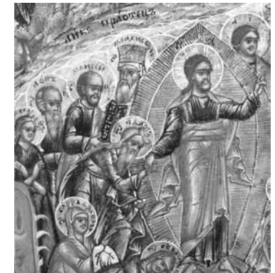
The Lord drawing Adam and Eve from Hades.

To me, this explains why thousands of years ago in the Lobombo Mountains of southern Africa they were mining red ochre, grinding it to powder and using it to bury their nobles, in the belief that their leaders would go to the Creator and intercede on their behalf. Now this practice wasn't an iso-