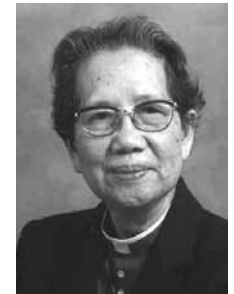
Florence Li Tim-Oi, first Anglican woman priest, 1944.