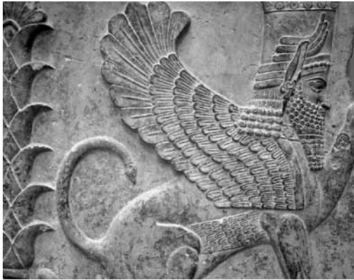
Ancient Indus River Valley carving from the time of Abraham.

We forget that Eve had a glorious high estate. She enjoyed a unique relationship with the Creator and with Adam. She was above the creatures. Now, suddenly, she listens to a creature and puts herself into subjection to