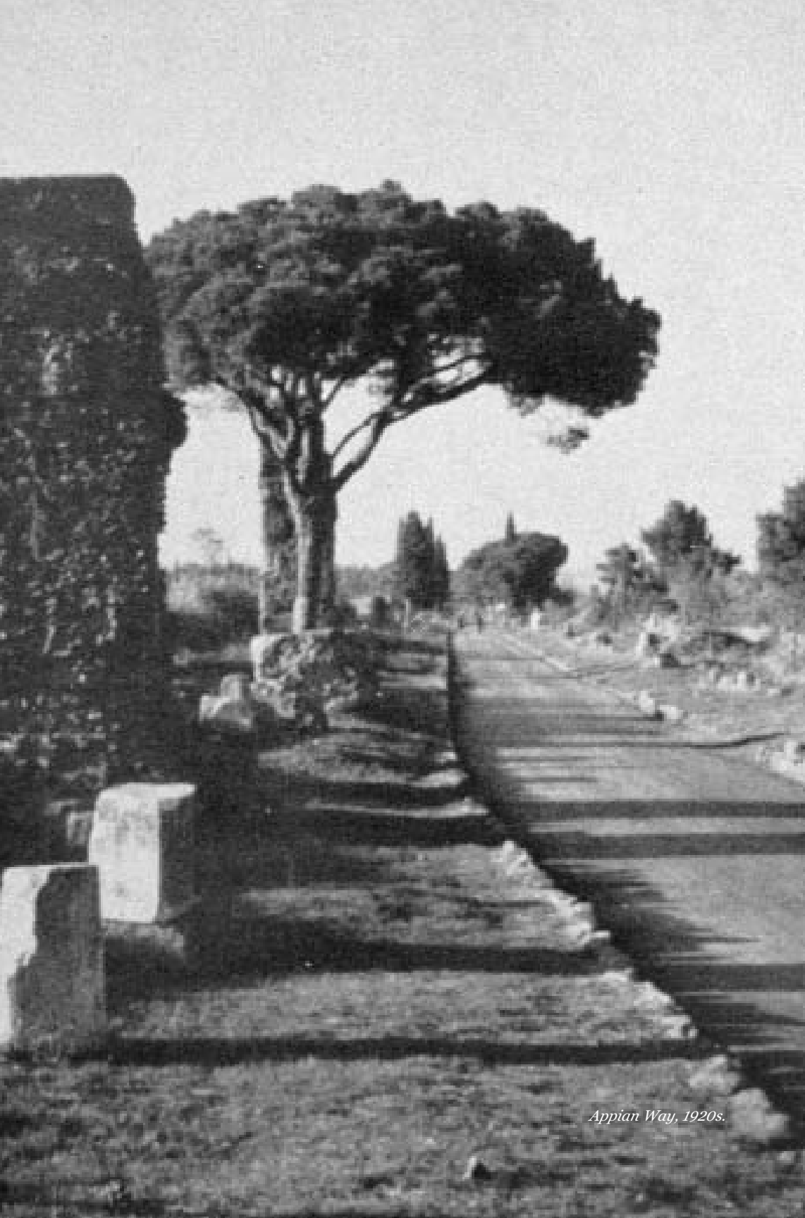
Appian Way, 1920s.

the graves of the martyrs from desecration, succeeding popes orchestrated the most massive disinternment in history, moving entire “cities of the dead” to churches inside the city walls. Relics and remains were brought into the city by the cartload, and when the famous Roman Pantheon was converted to a church in 609 A.D., 28 wagon-loads of bones were placed in the crypt, and 2,300 bodies in the nearby church of St. Prassede.