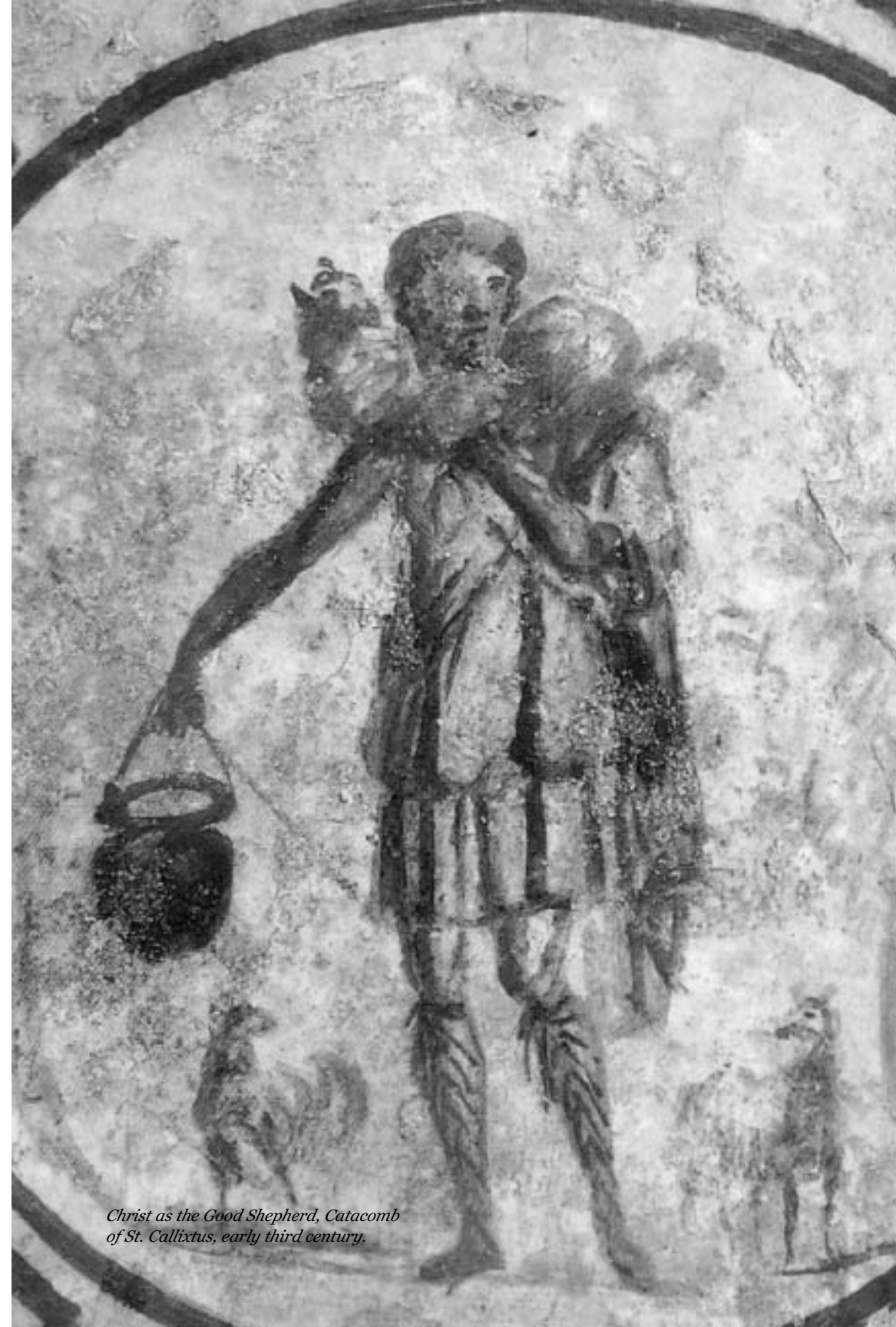
Christ as the Good Shepherd, Catacomb of St. Callixtus, early third century.

The “peace of Rome,” the secure springtime of the Christian Empire, was not to last, and Romans watched with horror as Goths and Lombards began their centuries-long assault on the Eternal City, repeatedly sacking the countryside catacombs for valuables. The Roman Church regularly restored and embellished its catacombs until the early 800's, when, in order to save