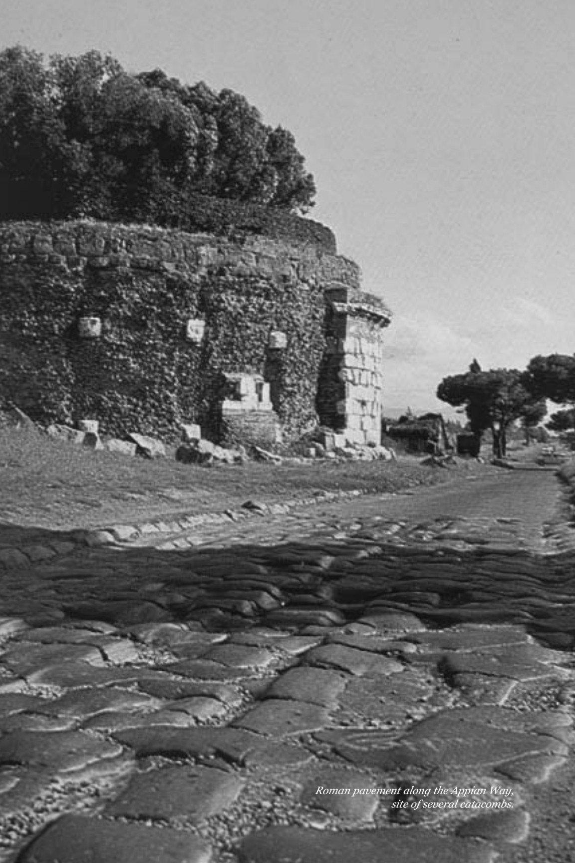
Roman pavement along the Appian Way, site of several catacombs.