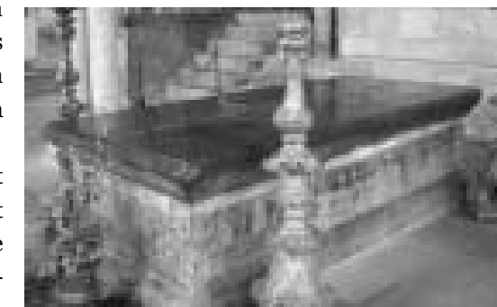
Venerable Bede's Tomb, Durham Cathedral.

So, when the Romans came here to Northumbria where Bede later lived, the peoples they found were these British peoples. Although the Romans obviously structured the local government around their own cities, they also accommodated these tribal areas and some of the British names were kept by the incoming Anglo-Saxons, such as Bernicia and Deira, the two parts of Northumbria.