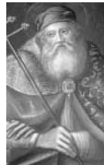
St. Gregory the Great.

There were also theological exiles in Rome from the East. In his attempts to reconcile the Monophysite Christians of Egypt and gain their support in his conflicts with the Persians and Arabs, Emperor Heraclius involved himself in theology by attempting to impose an unorthodox, compromise doctrine known as Monothelism 2 on the Church. He persecuted the doctrine's opponents, such as the great theologian of the seventh century, Maximus the Confessor, and many of them also made their way to Rome. The Lateran Council of 649 in Rome dealt with the question of Monothelism, which was condemned in 681 in Constantinople by the Sixth Ecumenical Council.