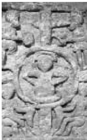
Cross Shaft, Lindisfarne Abbey.

RTE: Yet it is difficult to completely renounce this sense of "differentness" that many of us have felt in what we've thought of as the Celtic church.