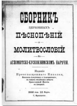
"Collection of Church Hymns and Prayers" in the Aglemiut-Kuskokwim dialect published in 1896.