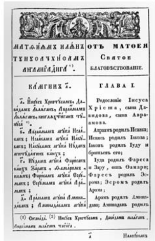
Original Aleut-language Holy Gospel of St. Matthew translated by St. Innocent Veniaminov and St. Jacob Netsvetov.

RTE: Years ago, I asked this same question of Kodiak natives, and they told me that they knew of nothing except some very old Slavonic-Aleut service books, still in use in small churches in the Aleutian Islands. They had been printed in the late 1800’s, under the influence of St. Innocent’s mission. How were you able to track down these sources?