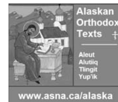
Official emblem of the historic Alaskan Orthodox Texts project.