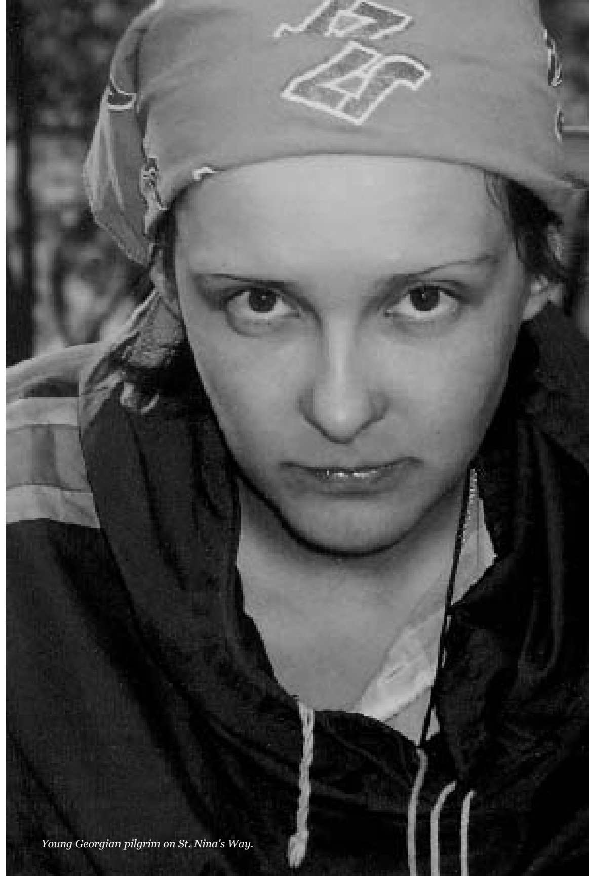
Young Georgian pilgrim on St. Nina's Way.

This young lady was frank with me and said that she had also become, so to speak, a witch. If I were not a priest I would have laughed, but I could clearly see this split in her consciousness. She had been baptized when she was fifteen and now, at eighteen, she had developed some demonic abilities. For example, she told me that she could attract the attention of young men using some forbidden practices, invoking demons, and that she could not