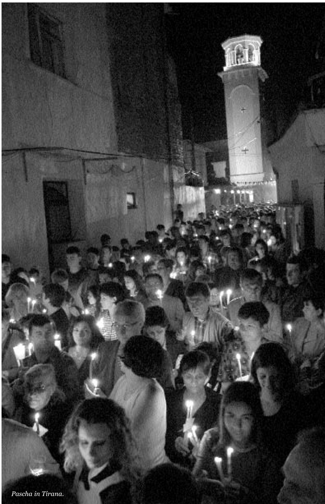
Pascha in Tirana.