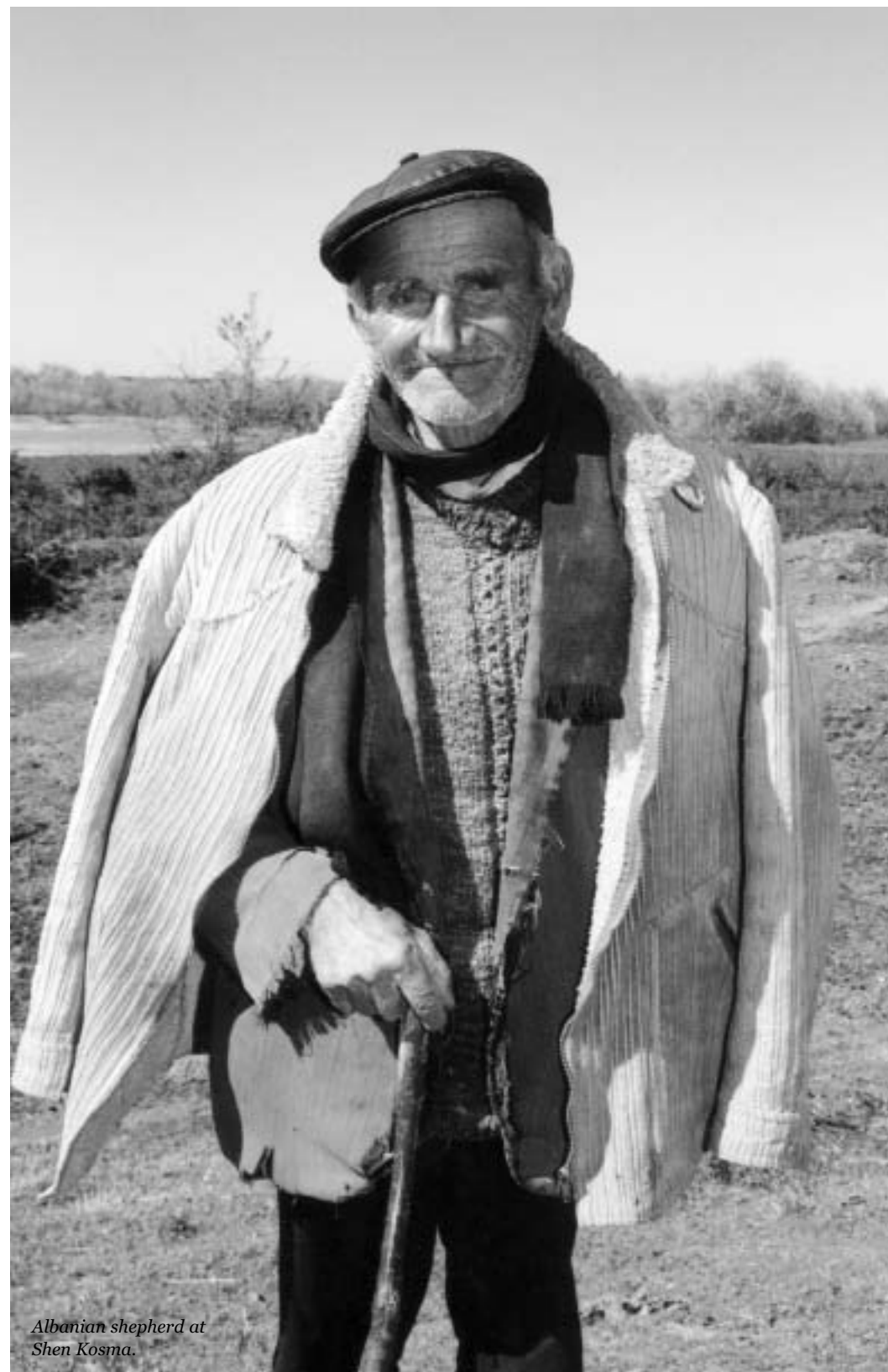
Albanian shepherd at Shen Kosma.

Farther on, a long wooden suspension footbridge spans the icy river. The connecting cables with wooden slats strung between them look shaky and I wonder if the laden donkeys can manage it. Our own paved road regresses to gravel and finally heavily rutted dirt as we wind down the Drinos River Valley, every turn a new panorama of fields and villages. A few hours from the border the road descends into a fantastic crater-like circle of mountains, the Shendelisse range; an immense lake mirrors the snow-covered peaks. Near the craggy pinnacles are small specks, large birds circling high in the air, the ever-present mountain eagles, Albania's national symbol.