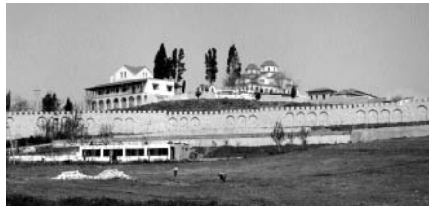
Shen Vlash (St. Blaise) Monastery and Seminary, Durrës.

and the academy difficult to get to from Tirana, but the church is full.