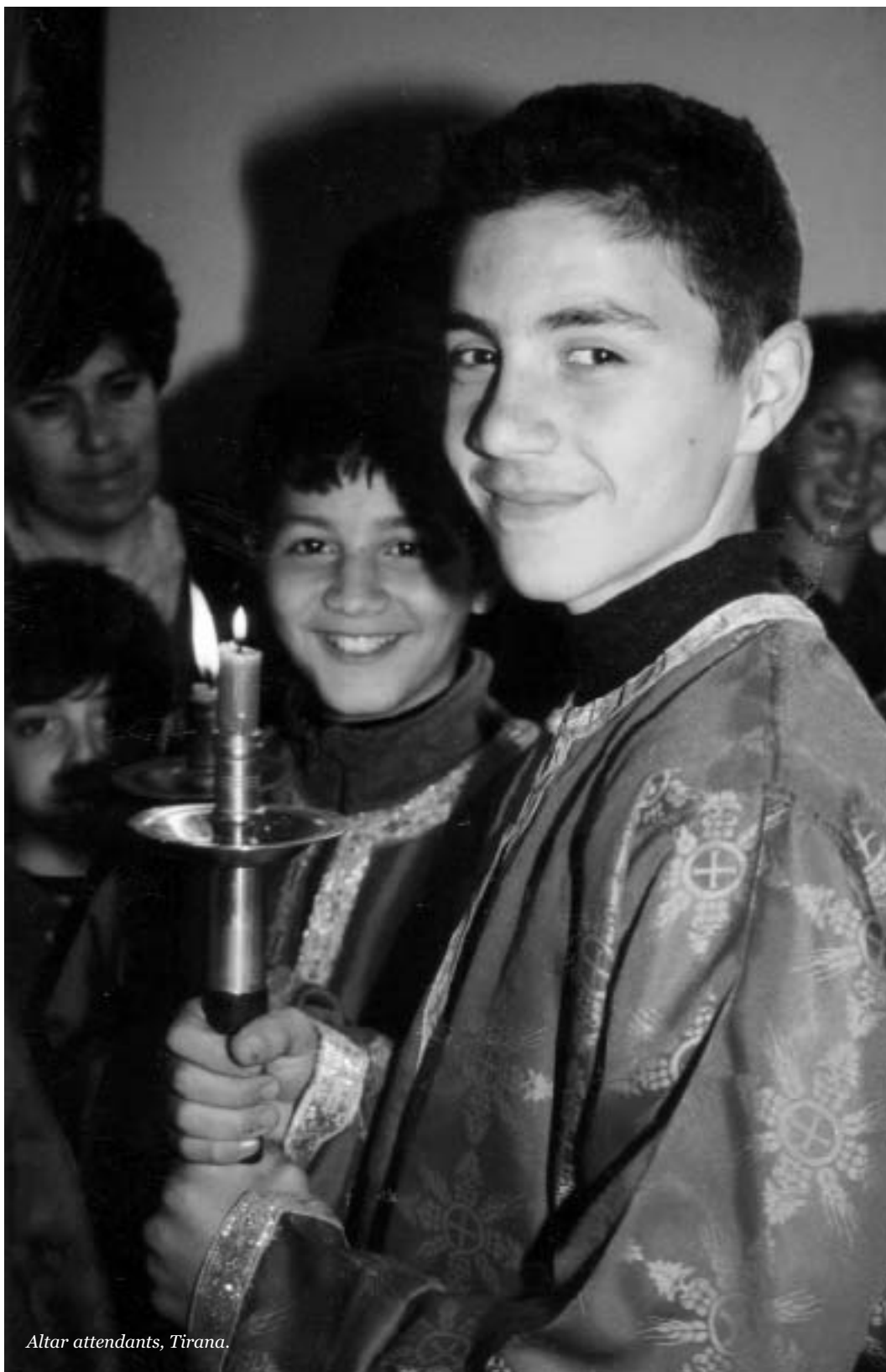
Altar attendants, Tirana.