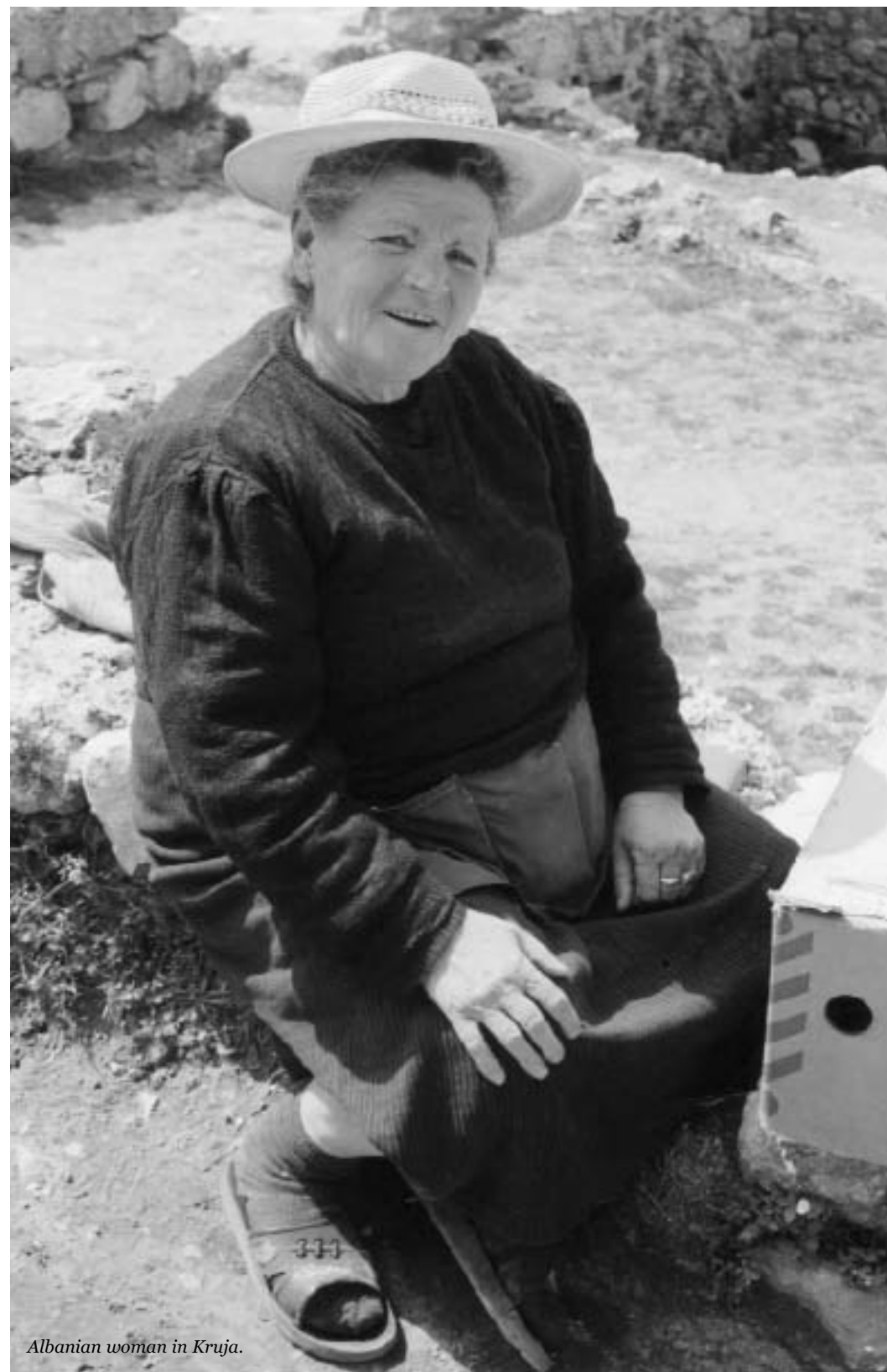
Albanian woman in Kruja.