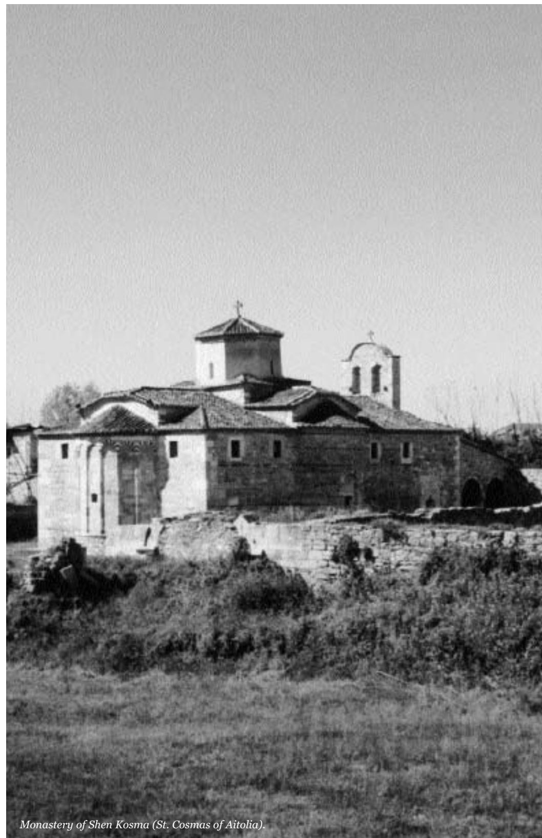
Monastery of Shen Kosma (St. Cosmas of Aitolia).

Later, I speak to a woman from the village of Yerma, near Sarande. She tells me that her village has always been poor, and although neighboring villages under the same circumstances have prospered, Yerma has not. The village's inhabitants attribute this to their ancestors' refusal to allow St. Cosmas to preach there. Yerma was one of very few places where he was refused entrance, and today's inhabitants insist that their lack of success is because the saint's blessing never rested on them.