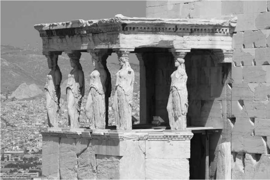
The Caryatid Porch of the Erechtheion, later a Byzantine Church dedicated to the Mother of God