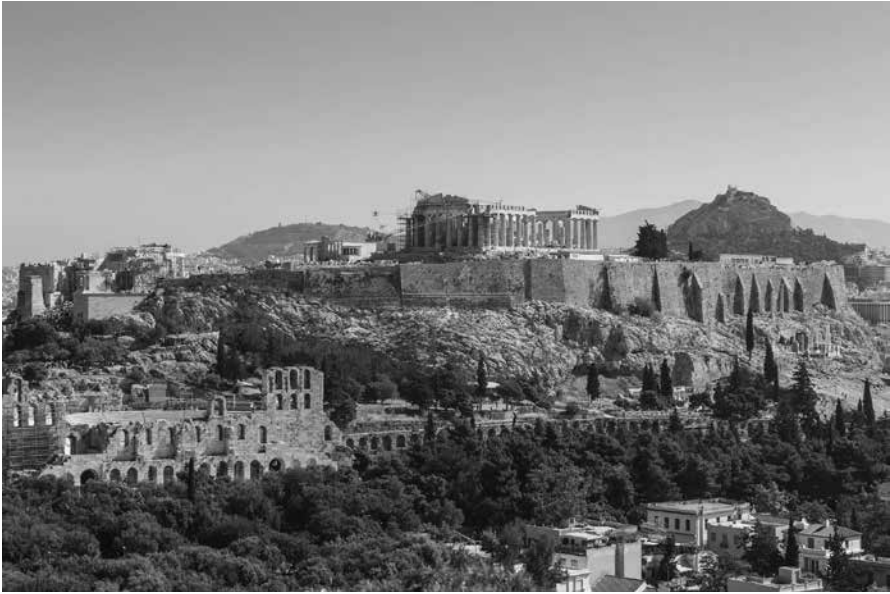
View of the south slope of the Acropolis.

proceeds of the spoils taken after an Athenian victory over the invading Persians. Also by Pheidias, the colossal bronze figure rose thirty feet from the bottom of the pedestal. Sunlight shining off the tip of Athena's spear could be seen by mariners off the Sunium coast, the southern-most point of Attica. Included in the Acropolis complex was the beautiful Propylea, the ancient entrance to the temple site; the smaller temple of Athena Nike, called "the jewel of Greek architecture," supported with ionic columns and housing another statue of Athena; and the Erechtheion, a bi-level structure that contained several shrines and the beautiful statues of the caryatids – marble maidens who upheld the south porch.