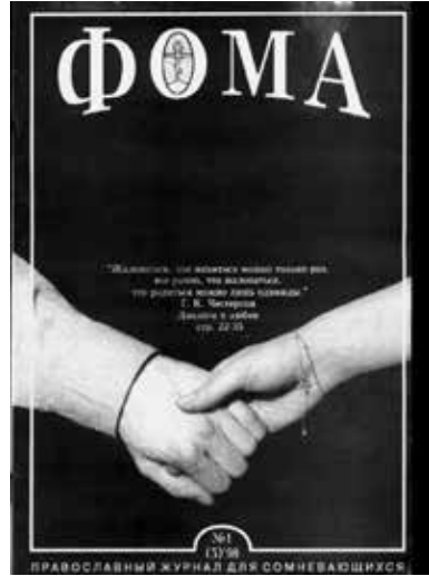
Early FOMA cover.

We also try to avoid any mentor-type preaching in our articles. Our journal is an attempt at dialogue. It's not a monologue; it's a dialogue. Also, our articles are not just about church life, they are also about everyday things in general: about life and death, suffering, if God is love why do people go to hell, etc. This helps people to think about Christianity.