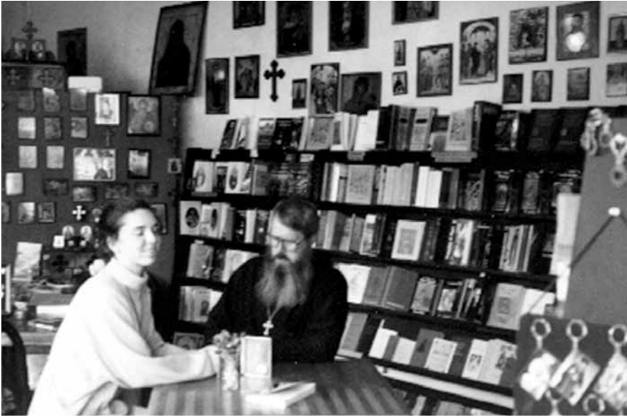
Heavenly Realm Orthodox Bookstore, Chico, California.