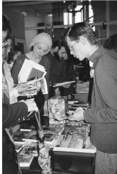
FOMA readers gather at literature table after meeting.

Also, we have to look at going beyond our magazine in practical ways. For example, one Orthodox editor was speaking to me of journals that come out strongly against abortion. Her comment was, “I don’t think they should write articles like that. If you write and say it is a terrible sin, then it means that you