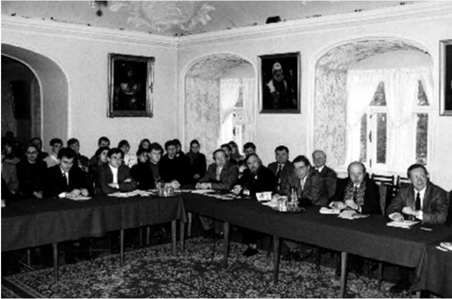
Meeting between future diplomats and seminarians at Holy Trinity-St. Sergius Lavra.

a tragic story, but they actively asked for people to help change the child's situation, and they did. This is the kind of thing I envisage for our journal.