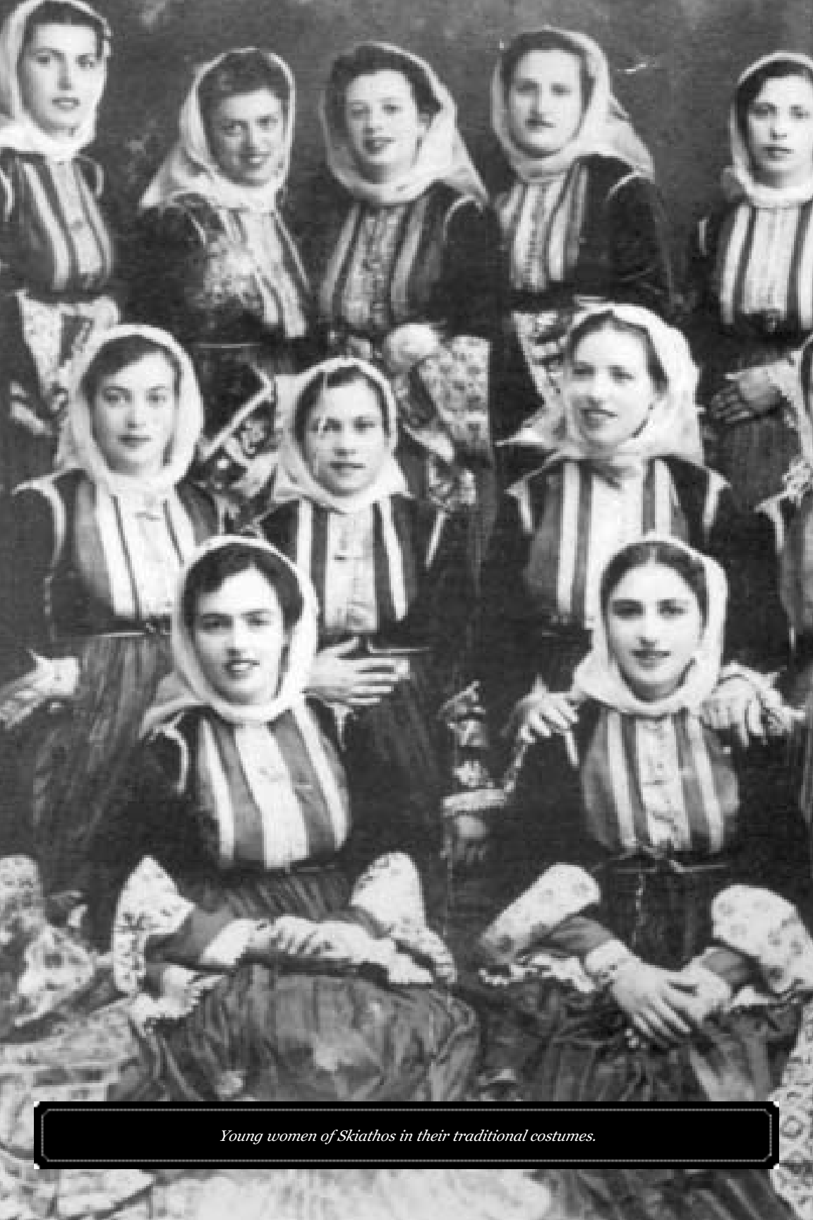
Young women of Skiathos in their traditional costumes.