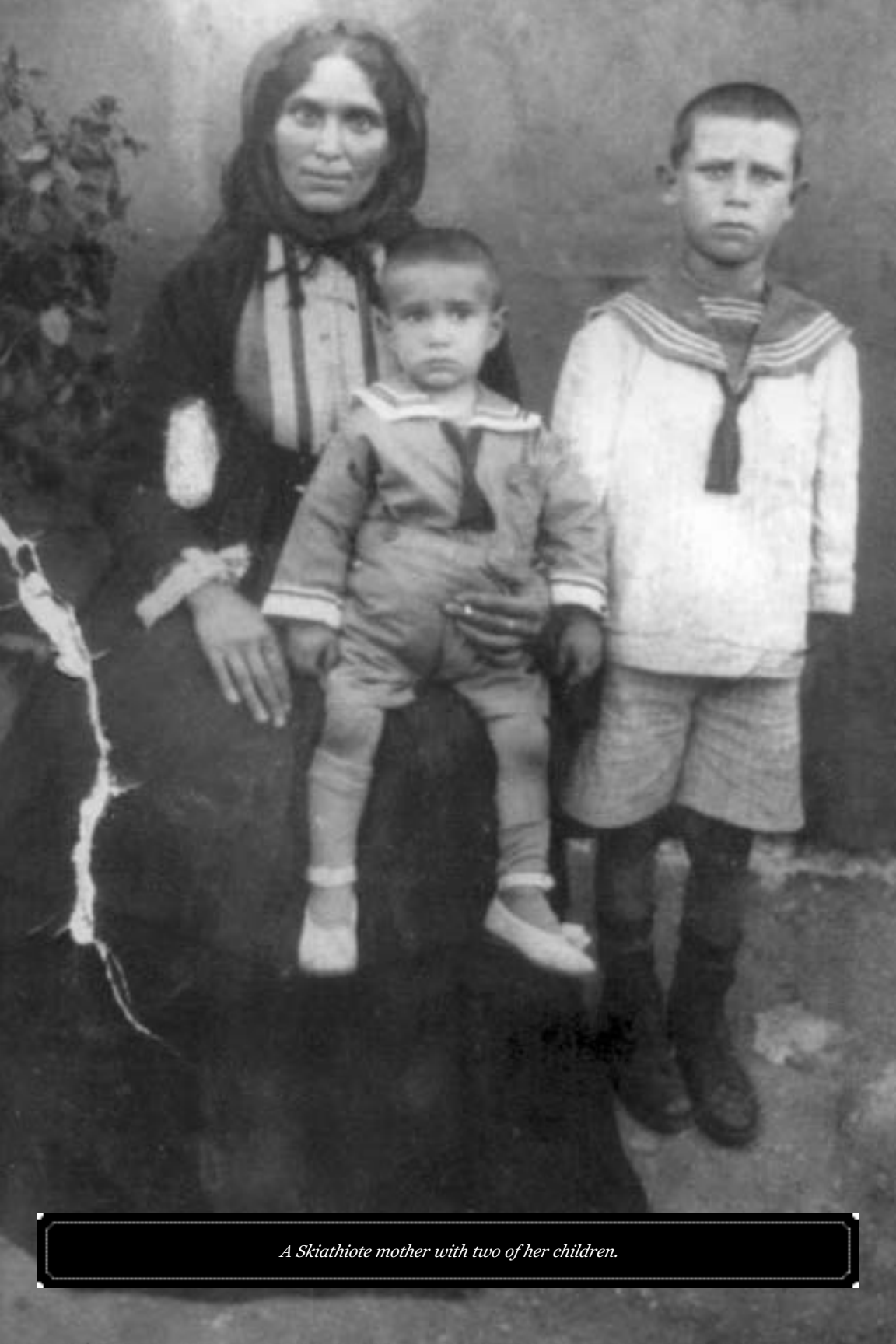
A Skiathiote mother with two of her children.