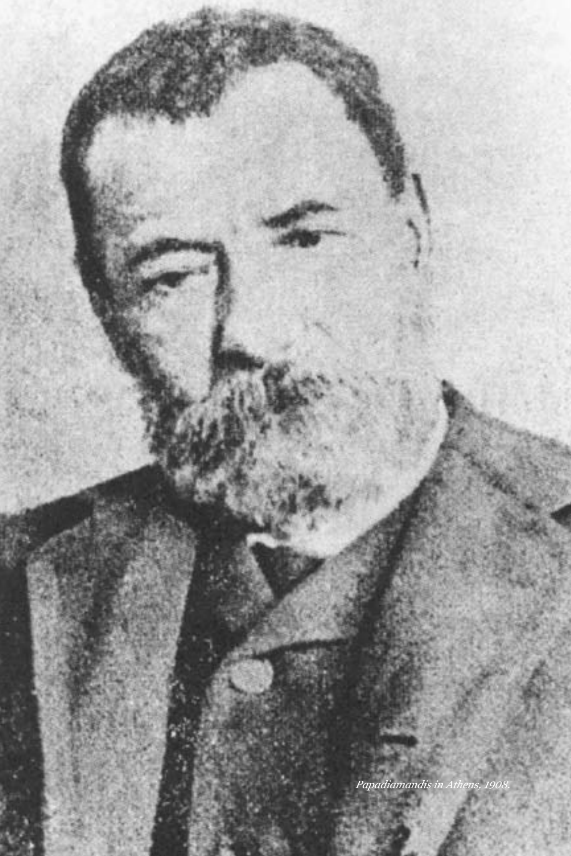
Papadiamandis in Athens, 1908.