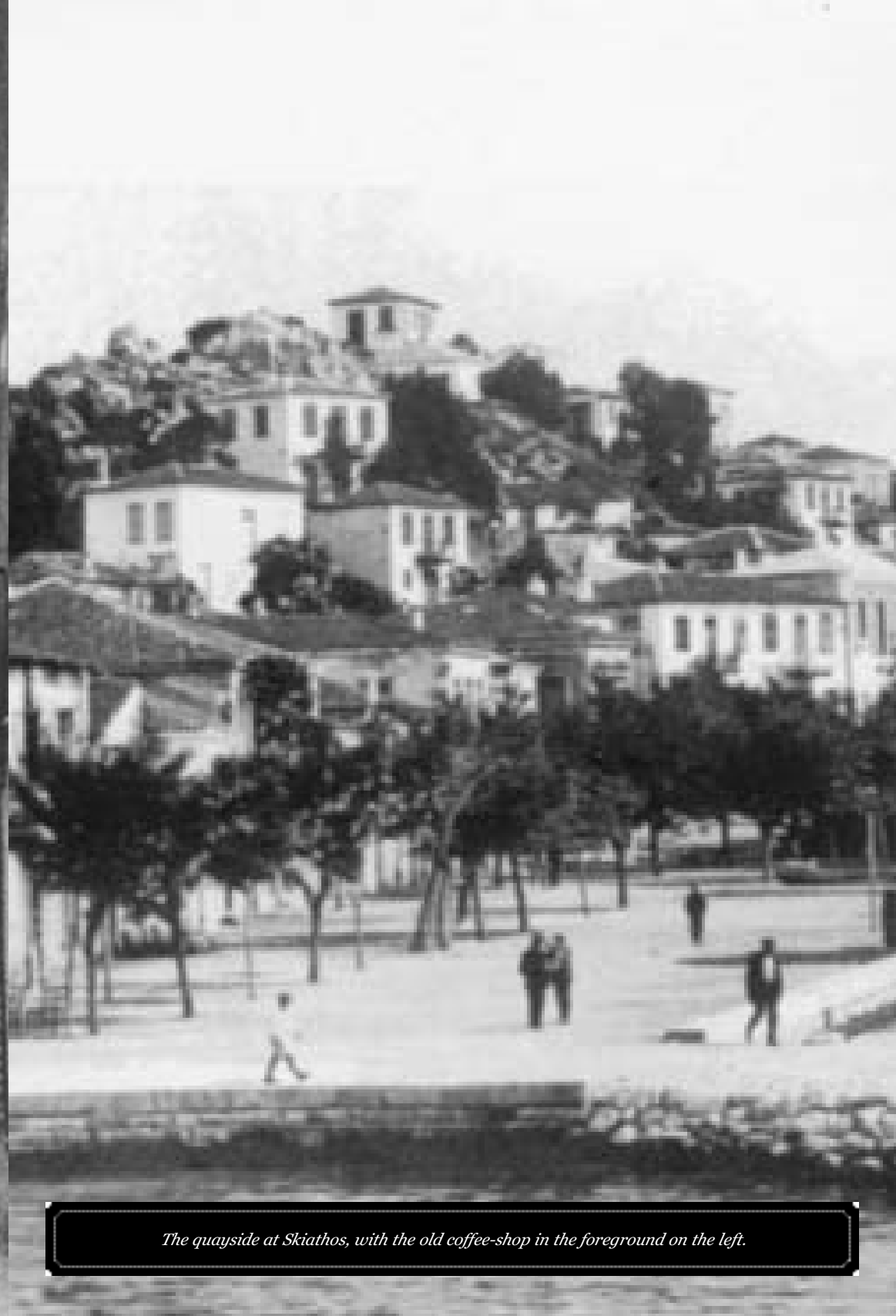
The quayside at Skiathos, with the old coffee-shop in the foreground on the left.