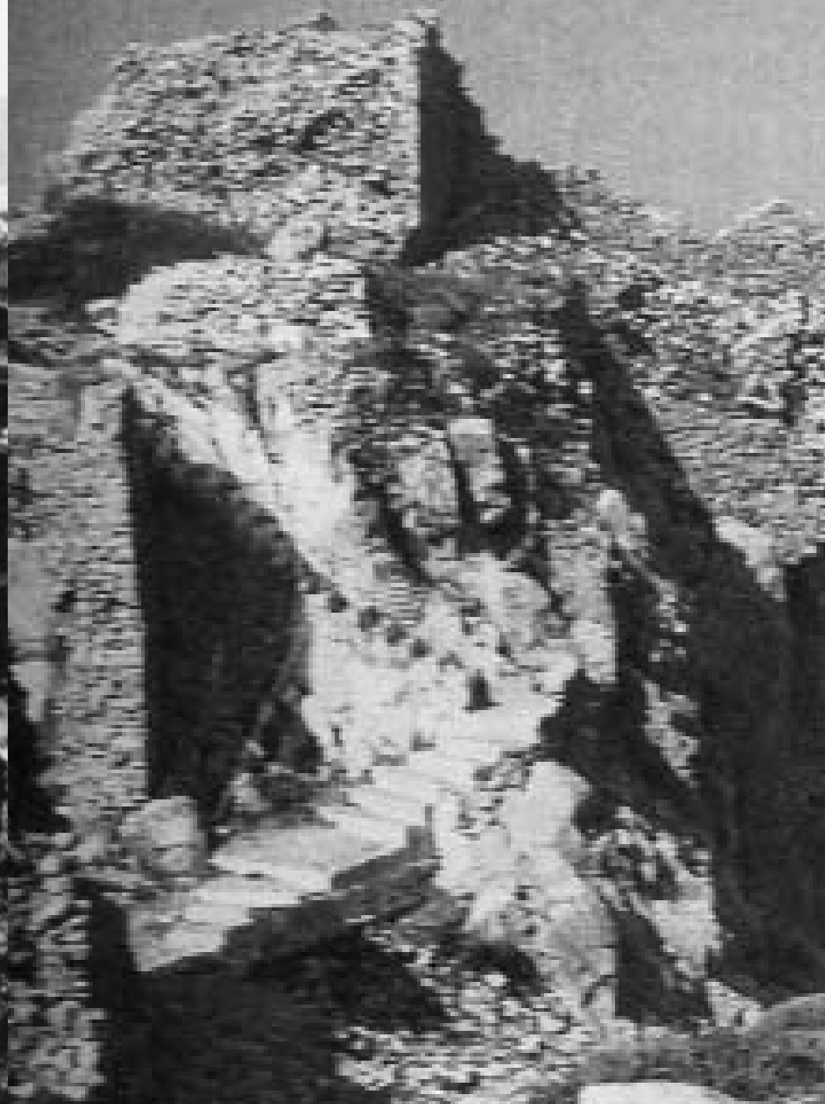
The Kastro, the old citidal of Skiathos, which was often featured in Papdiamandis' stories.