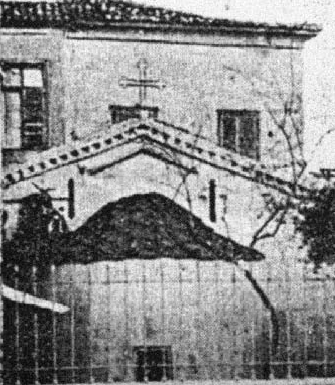
The church of St. Elissaios in the old Plaka quarter of Athens, where St. Nicholas Planas celebrated and Papadiamandis was chanter, before it was pulled down at the end of the second world war.