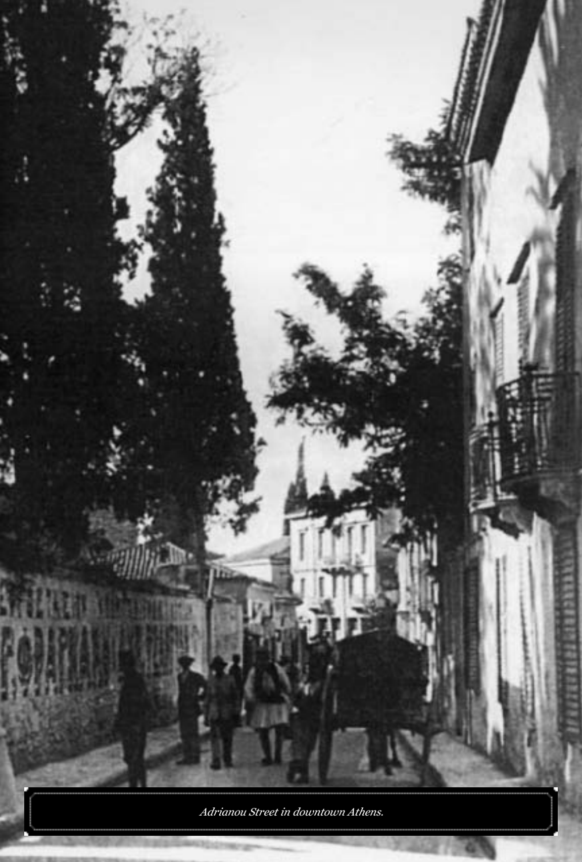
Adrianou Street in downtown Athens.