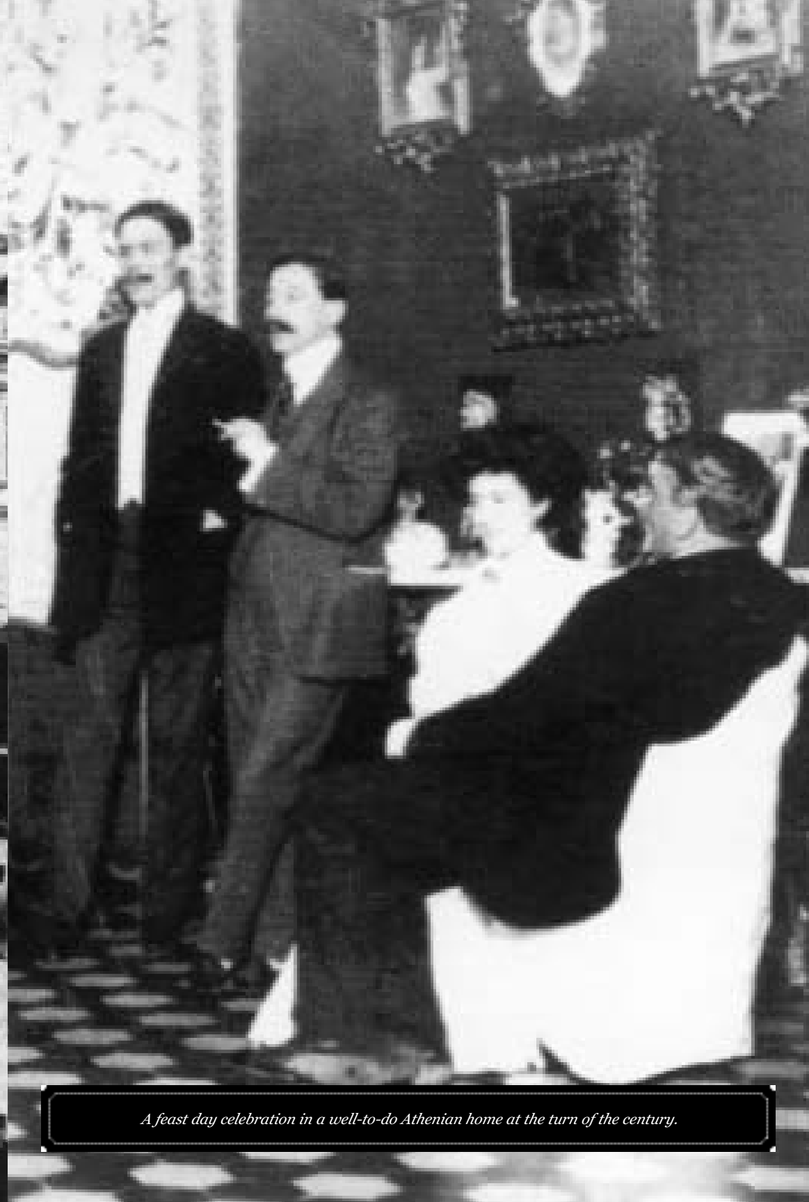
A feast day celebration in a well-to-do Athenian home at the turn of the century.