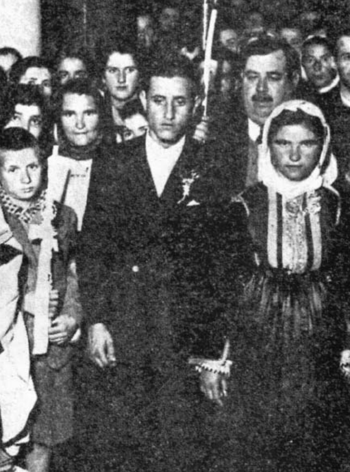
A wedding in Skiathos.