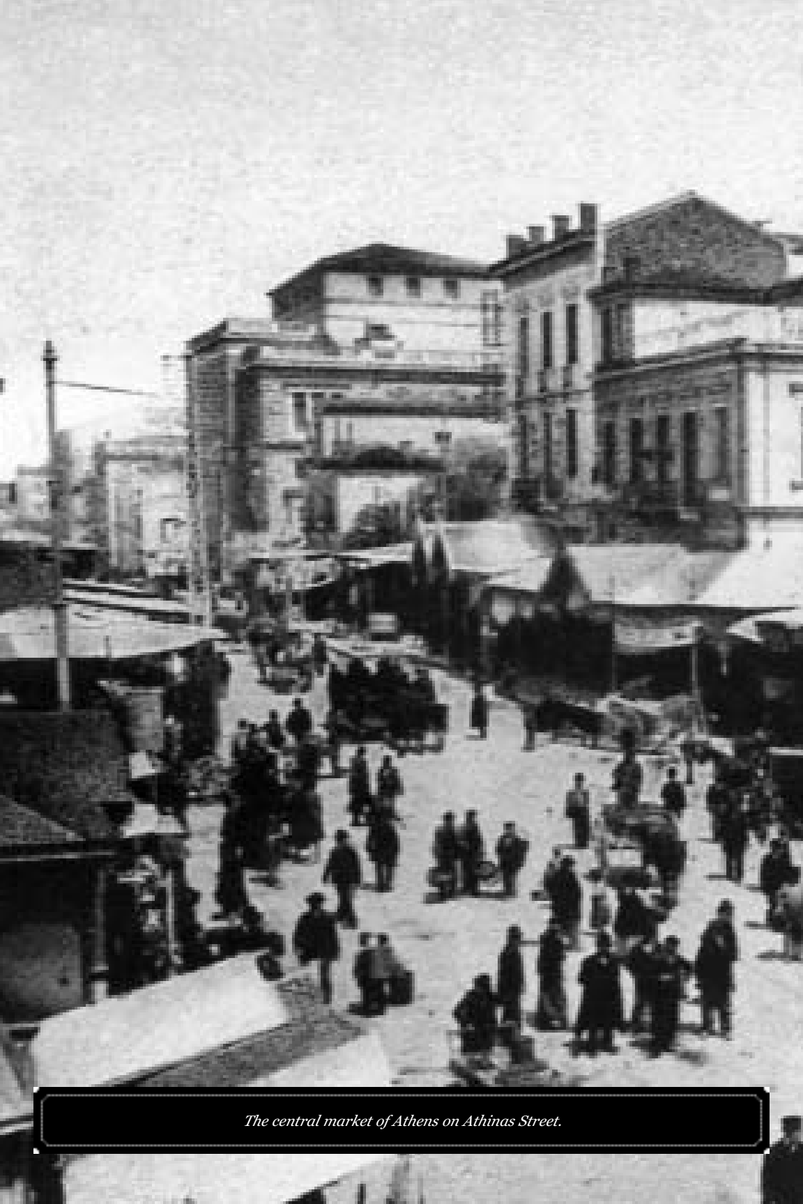
The central market of Athens on Athinas Street.