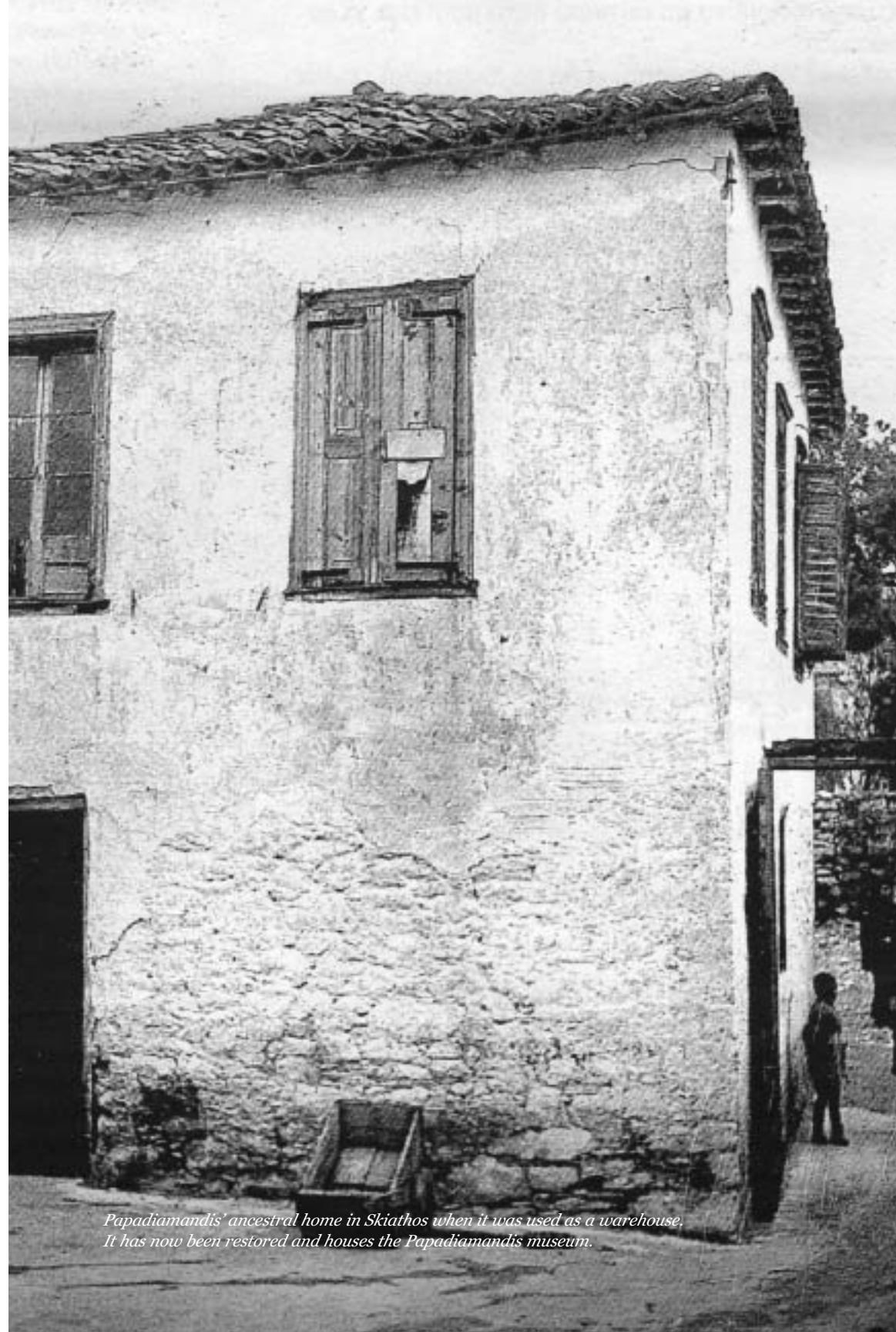
Papadiamandis' ancestral home in Skiathos when it was used as a warehouse. It has now been restored and houses the Papadiamandis museum.