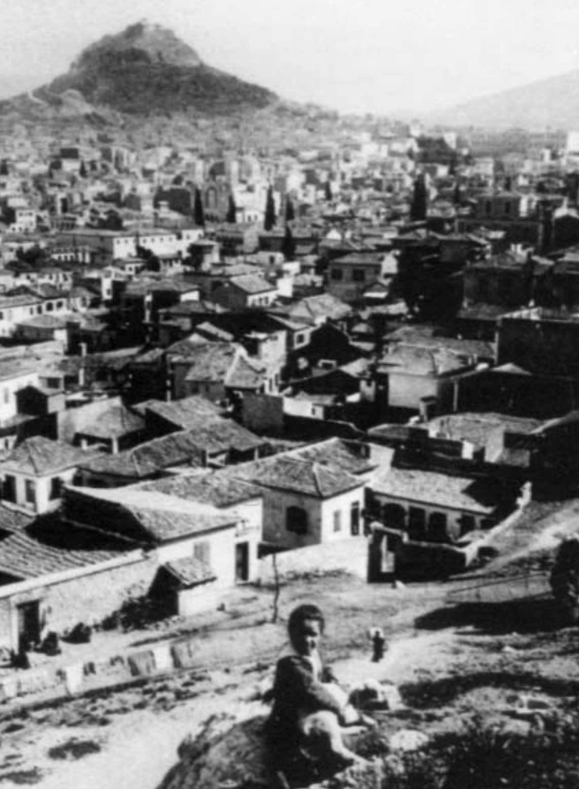
Old Athens from the hill of Areopagas with Mount Lycabettus in the background, 1897.