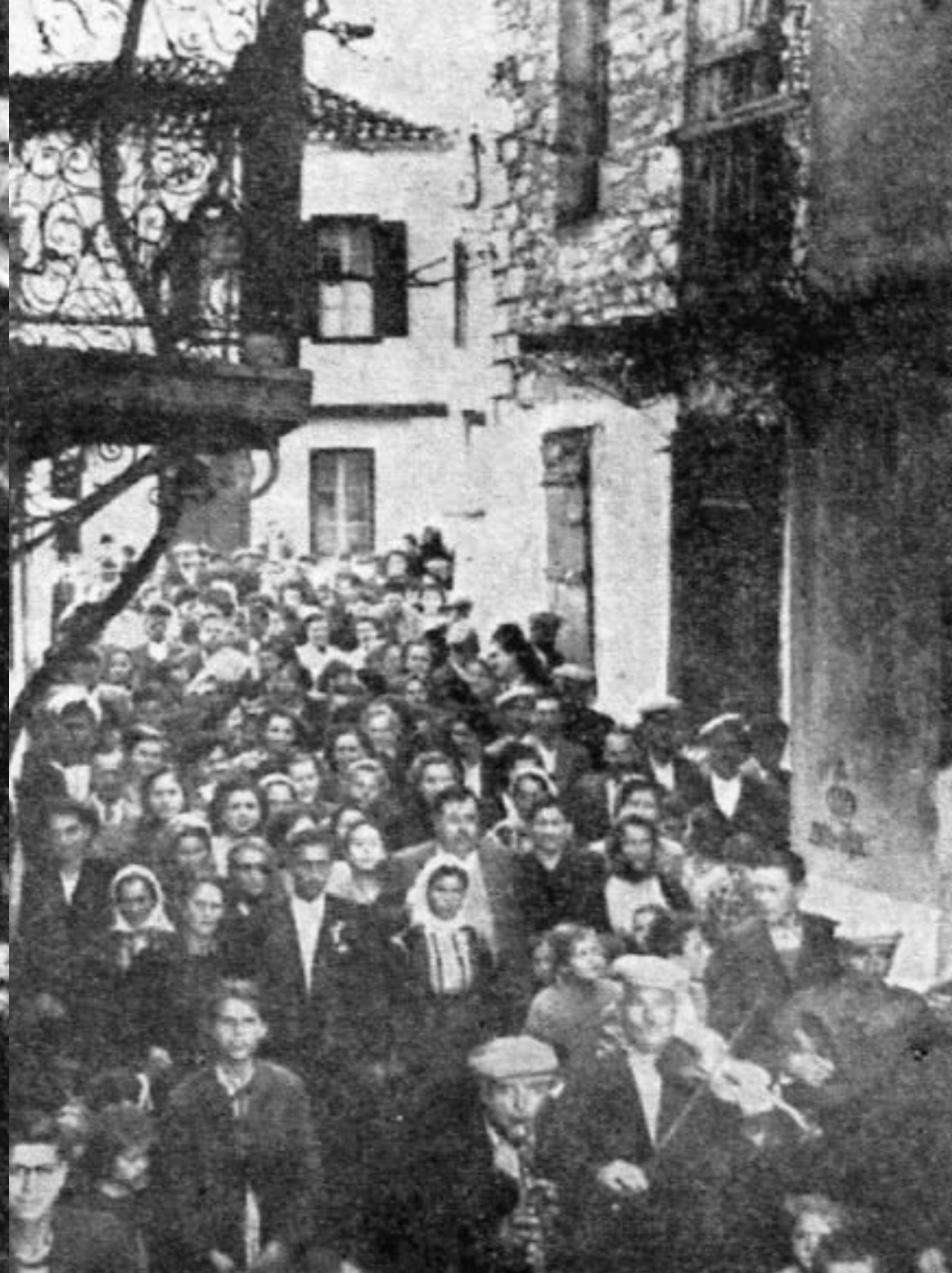
The marriage procession through the streets of Skiathos after the wedding.