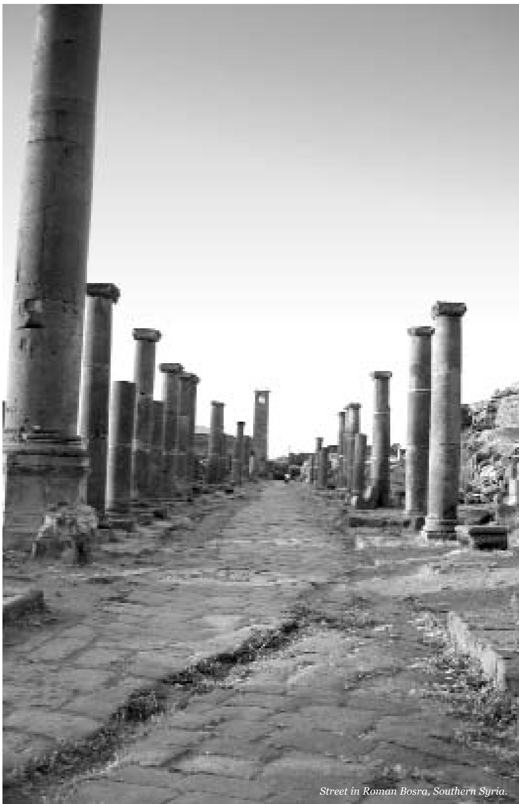
Street in Roman Bosra, Southern Syria.

Jerusalem, Antioch and Constantinople. In 1268 the Muslim Mamluk ruler Baibars destroyed Antioch and the patriarchal see then moved to Damascus (1375-1386).