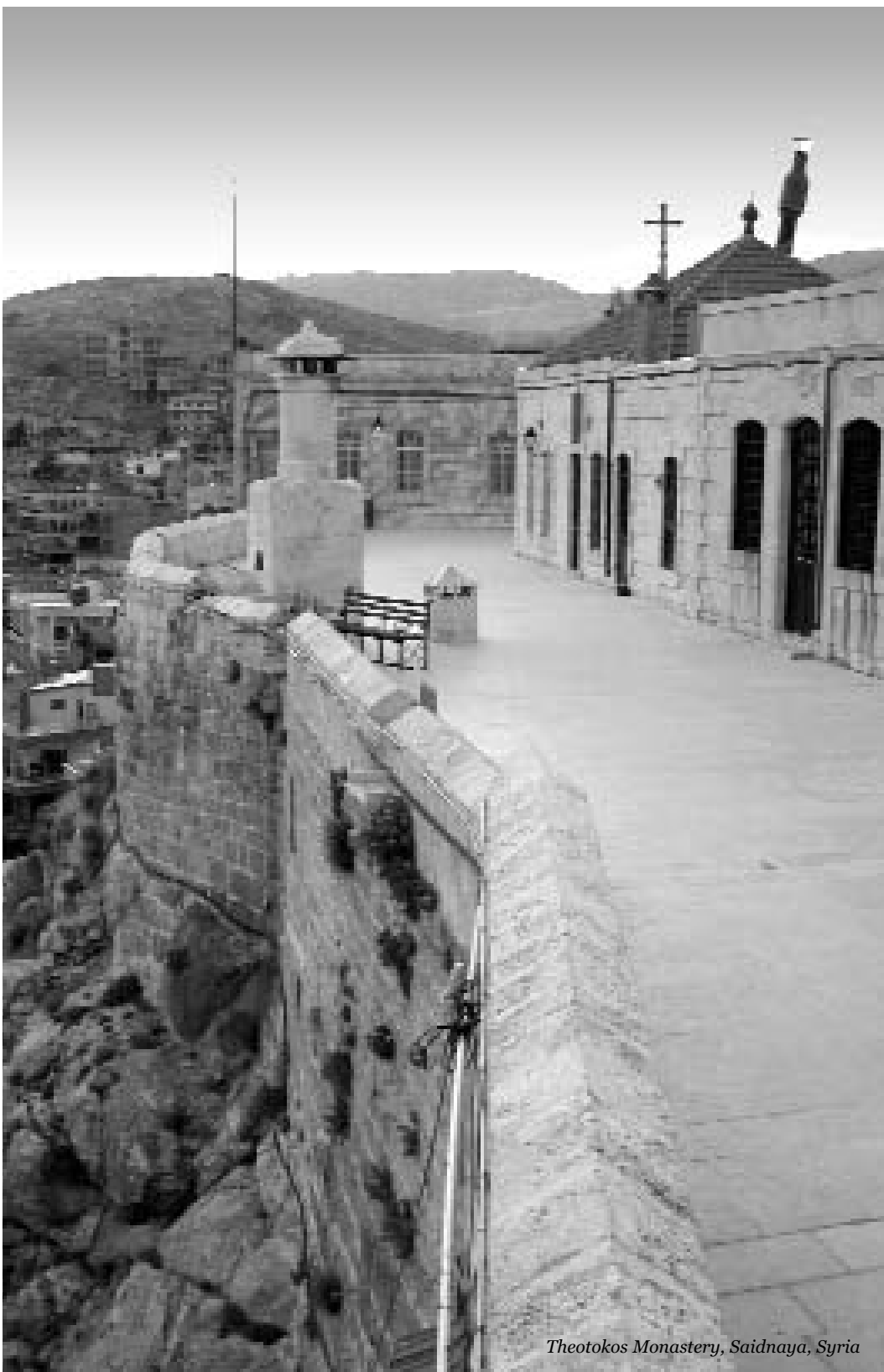
Theotokos Monastery, Saidnaya, Syria

Although he was Bishop of Nineveh for a few months in the Church of the East, he is still widely read in Orthodoxy and considered a saint.