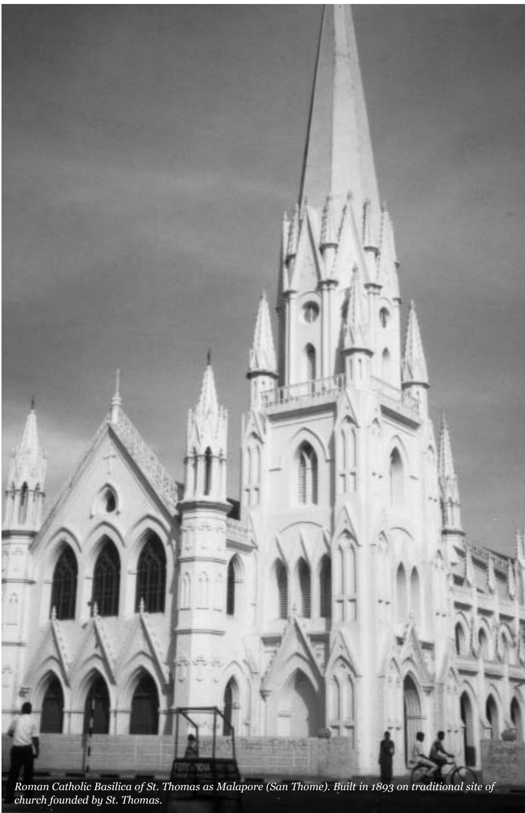
Roman Catholic Basilica of St. Thomas as Malapore (San Thome). Built in 1893 on traditional site of church founded by St. Thomas.