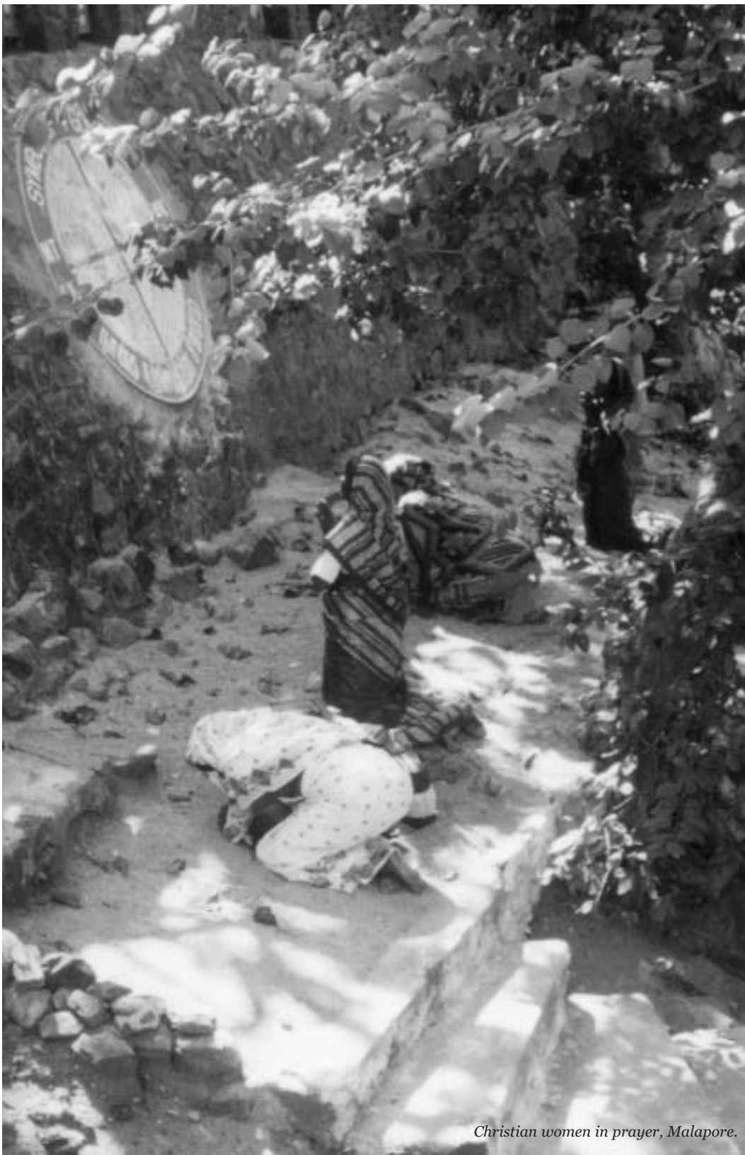
Christian women in prayer, Malapore.