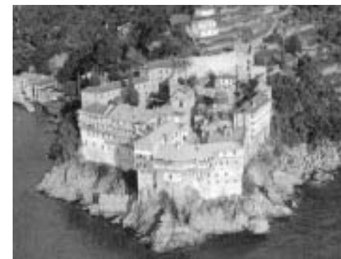
Grigoriou Monastery, Mt. Athos.

Over the past few months I have been forced to do all of the confessions on my own. In this I have lived intensely the drama of our fellow men. A