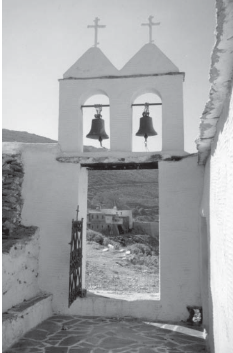
St. Nicholas Monastery from Chapel of Prophet Elias

Following is the first contemporary history of St. Nicholas Monastery, material that I have gathered from the monks and pilgrims during a decade of pilgrimage.