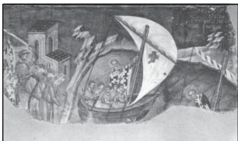
St. Nicholas – patron saint of sailors and fishermen