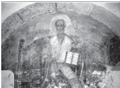
Fresco of St. Nicholas the Wonder-worker

During Father Nicholas' time in Patara, a prominent merchant of the town fell into extreme poverty. When he was finally lacking even the barest necessities and did not know how he was to feed his family, he fell into despair and