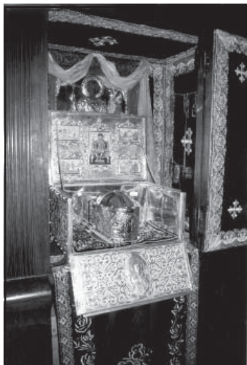
Relics of St. Nicholas the New

The monastery also enshrines the lower jaw of the "Apostle to the Greeks" St. Cosmas of Aitolia (1714-1779), who, like a new St. Paul, traveled the length and breadth of Greece in the darkest years of the Turkish occupation. 1 Encouraging Christians to maintain their faith, he established hundreds of schools to revive Greek language, culture, and catechesis. St. Cosmas' influence was arguably the single most important factor in maintaining Orthodox tradition and practice in mainland Greece during the difficult centuries after the fall of Constantinople. His relics are particularly treasured here because of his connection with the monastery. On one of his many travels St. Cosmas sailed into the nearby port of Akhla, where the monks maintain a small chapel dedicated to St. Nicholas the New. It is very likely that the saint visited the monastery and was acquainted with the abbot, for later, when some of his followers from Epirus wanted to follow him into monasticism he sent them to St. Nicholas