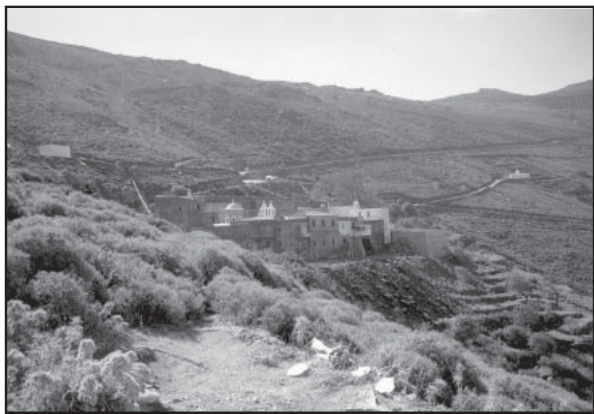
St. Nicholas Monastery

Although occupied successively by the Ionians, Spartans, Venetians and Turks, the island had a relatively peaceful history and was not nearly as affected by the fortunes of war and occupation as other parts of Greece. As with all the Greek islands in the Aegean, however, Andros was prey to Saracen pirates. Although the monastery is not readily seen from the road above, it was discovered by pirates in the seventeenth century. Climbing down the hill to loot it, they