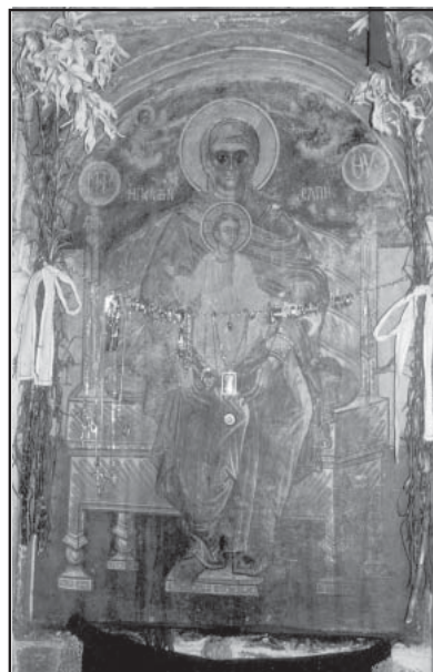
Weeping fresco of the Mother of God

the fifteenth century, which has miraculously wept several times over the past decade, notably during the Gulf War of 1991 and at the beginning of the Serbian conflict. The fresco, painted directly onto the stone wall, has a continual