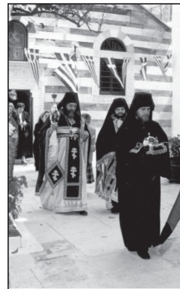
Pascha procession with relics

In a similar occurrence, three commanders of Emperor Constantine’s army who had recently returned from successfully putting down a revolt in Phrygia